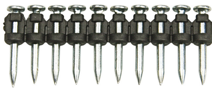
TKA standard nails for gas nailer FOX