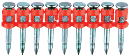
XHA premium nails for gas nailer FOX